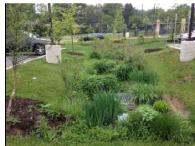
RAIN GARDEN AREA IMAGE